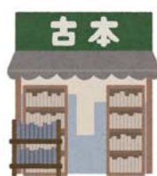
a secondhand bookstore